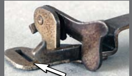
Slot for hook coupler

The Type 1 coupler was prone to unwanted uncoupling. Lionel engineers soon developed a solution to the unwanted uncoupling but at a significant cost increase. The new version also had reliability problems.