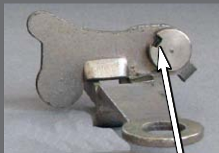
Notch to retain spring

Left, Type 3 latch coupler, 1928-42 with notch in rivet to retain spring. Right, Type 3s (slot) latch coupler, 1928-32 with notch in rivet to retain spring and slot for hook coupler. This improvement had four parts to assemble and was resistant to damage from rough handling.