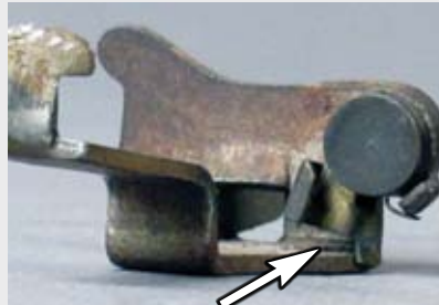
Brass spring retainer

Left, Type 2 latch coupler, 1925-27 with arrow pointing to the brass spring retainer. Right, Type 2s (slot) latch coupler with brass spring retainer and arrow pointing to added slot for a hook coupler. Type 2 had five parts to assemble, and the brass spring retainer was easily damaged by rough handling. Lionel engineers soon developed a solution.