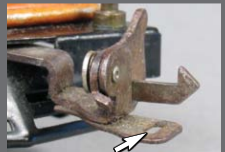
Slot for hook coupler