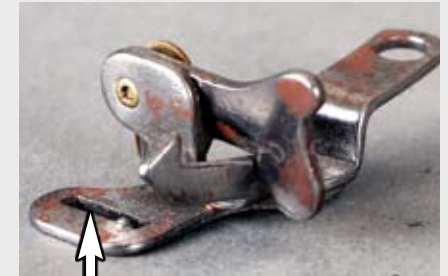
Slot for hook coupler

Left, Type 3 latch coupler, 1928-42 with notch in rivet to retain spring. Right, Type 3s (slot) latch coupler, 1928-32 with notch in rivet to retain spring and slot for hook coupler. This improvement had four parts to assemble and was resistant to damage from rough handling.