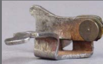
Coupler without spring

Left, Type 1 latch coupler with no spring, 1923-25. Right, Type 1s (slot) latch coupler with no spring, 1923-25 with an added slot for cars with hook couplers. The slot was added so that cars with hook couplers could couple with the new latch couplers. The Type 1 coupler without slot has three pieces to assemble.